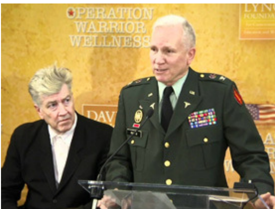
Dr. Rees' first presentation was given to

He also discussed a second study, accepted but not yet published in the JOTS , which shows that even within 10 days of learning TM, a group of Africans with high levels of PTSD symptoms had clinically significant reduction in symptoms.